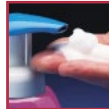
Foamer in Use