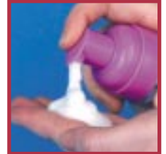
Foamer in Use